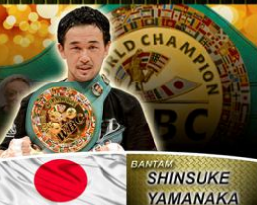
BANTAM SHINSUKE YAMANAKA