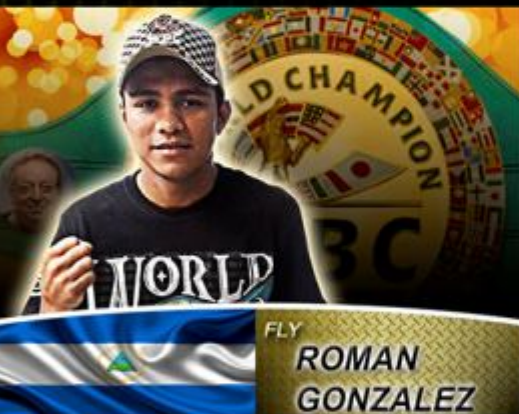
FLY ROMAN GONZALEZ

WBA Kohei Kono IBF McJoe Arroyo WBO Naoya Inoue